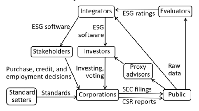
Figure 1. The ESG Information System<sup>32</sup>

"Standards," as used here, are definitions of the data to be collected. For example, this is the GRI standard for Direct (Scope 1) GHG [Greenhouse Gas] emissions: